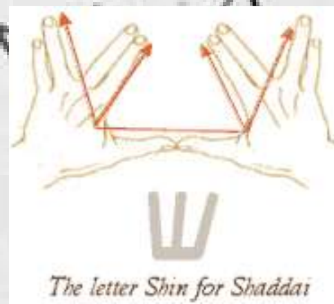
The letter Shin for Shaddai